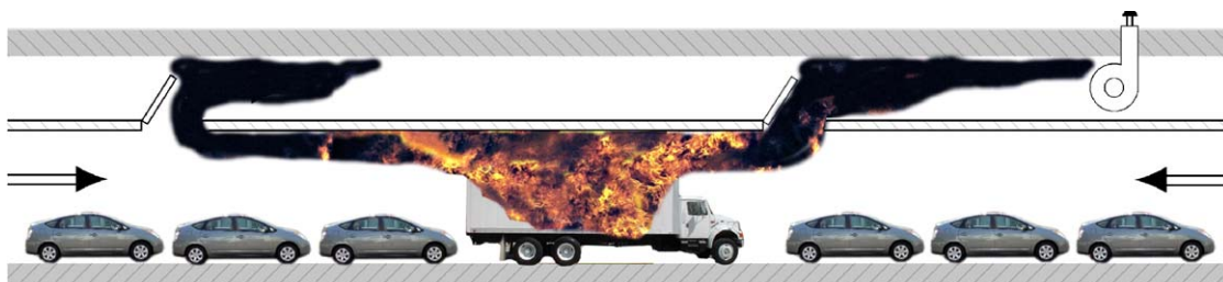
Fig. 2. An exhaust ventilation system with large extraction vents that can be opened close to the site of a fire will protect cars and passengers from smoke and fire gases, and will allow the fire brigade to attack the fire from two sides.